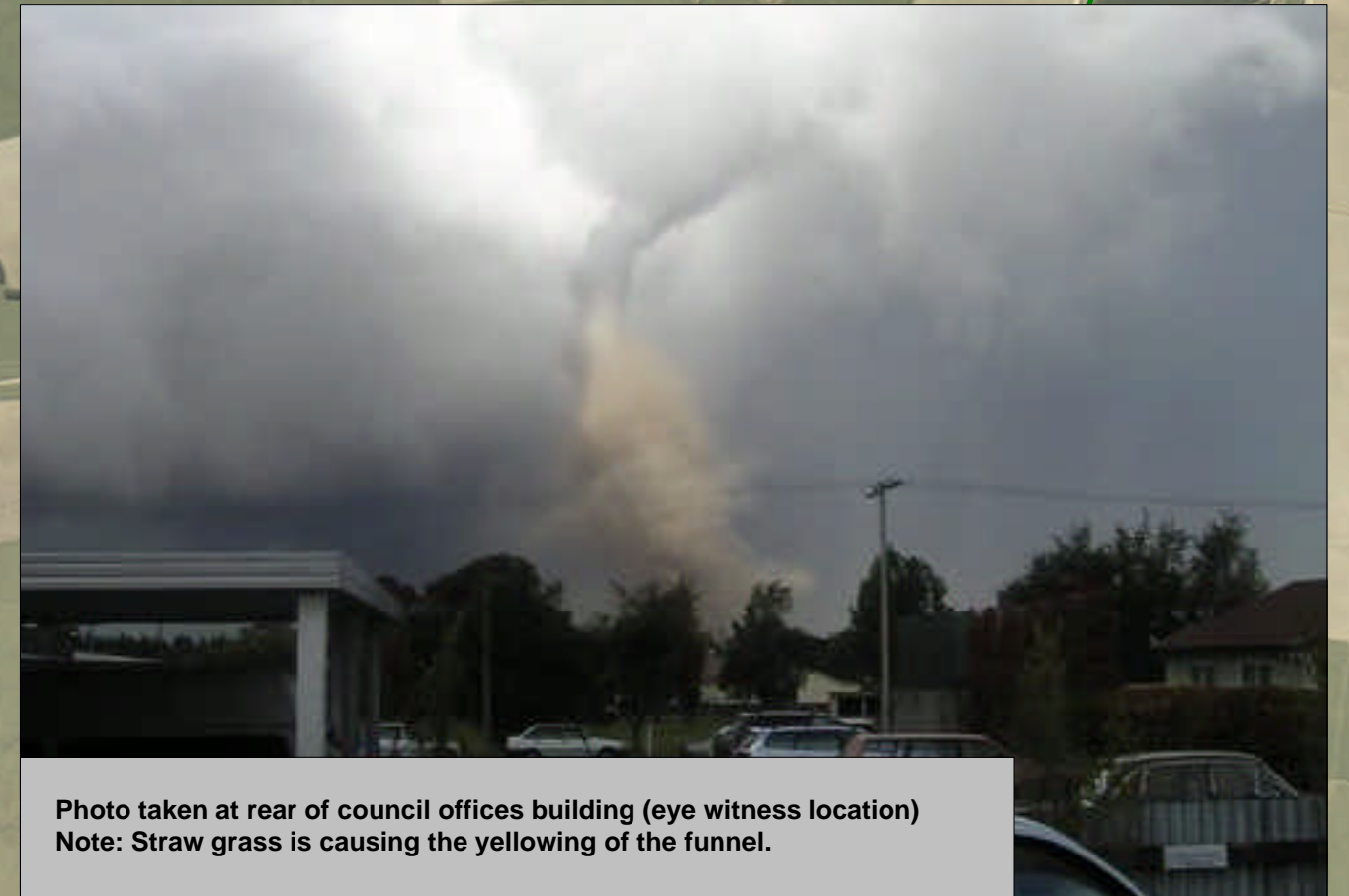
Photo taken at rear of council offices building (eye witness location) Note: Straw grass is causing the yellowing of the funnel.