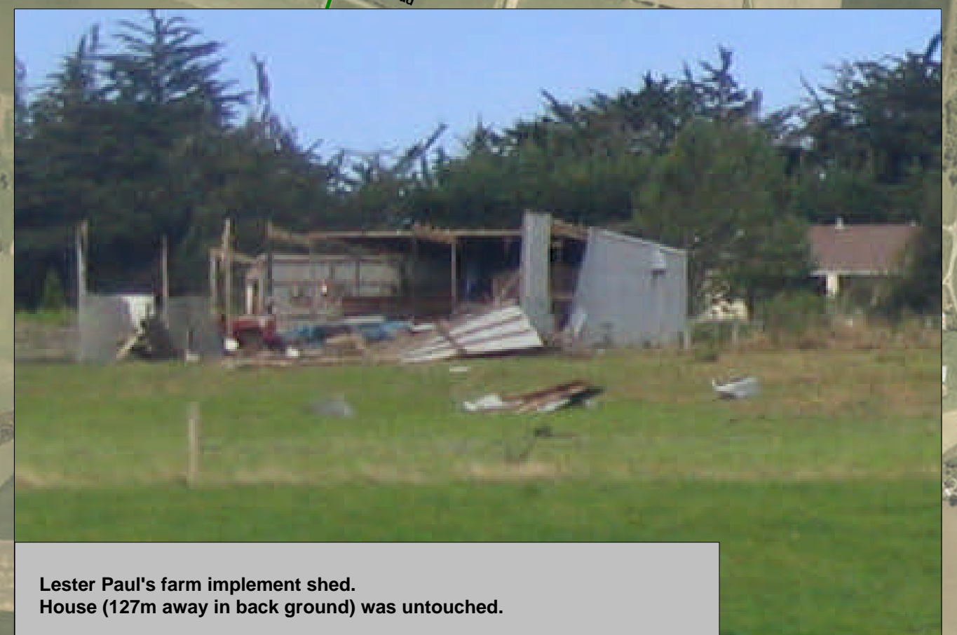
Lester Paul's farm implement shed. House (127m away in back ground) was untouched.