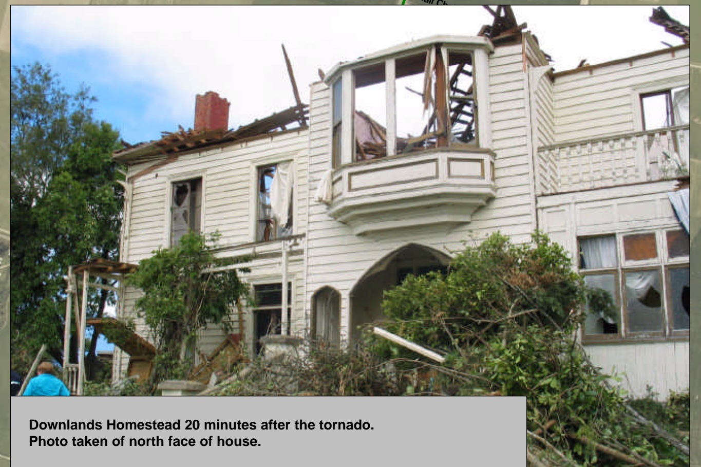
Downlands Homestead 20 minutes after the tornado. Photo taken of north face of house.