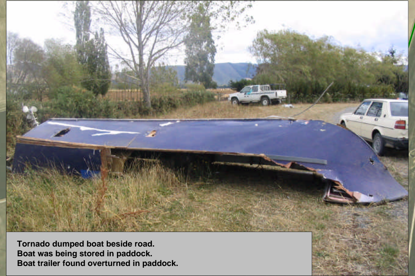
Tornado dumped boat beside road. Boat was being stored in paddock. Boat trailer found overturned in paddock.